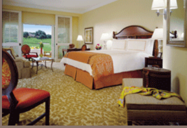
Four Seasons Resort Dallas at Las Colinas Irving, Villa Room