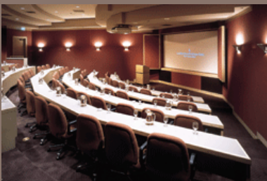
Irving Meeting Space

In an atmosphere created for business, traditional Southern charm and big-city amenities decorate the lively city of Irving, Texas