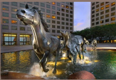
Mustangs of Las Colinas