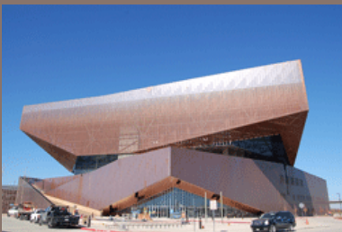
Irving Convention Center